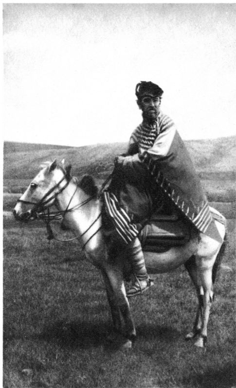
Frater Perdurabo. on the Deosai Plateau. End of his first Himalayan Expedition.