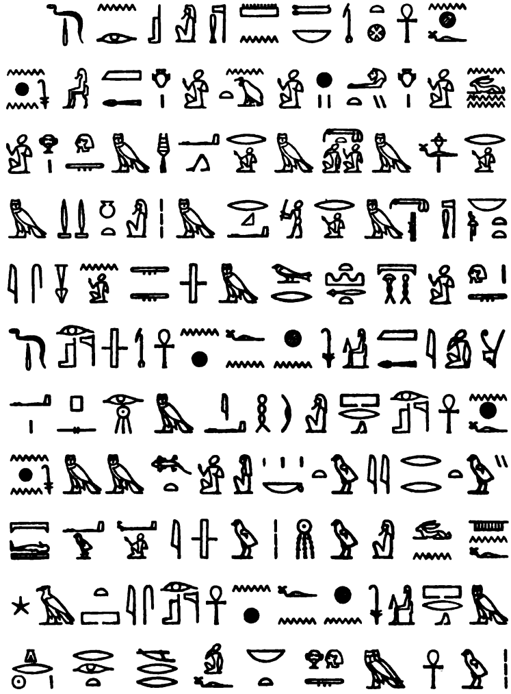
STELE OF ANKH-F-N-KHONSU.