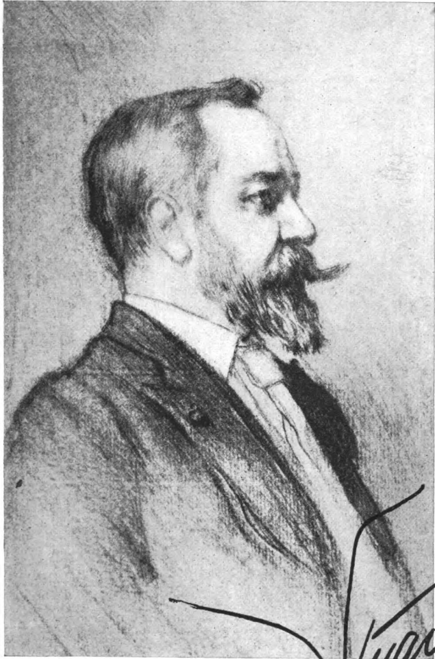
From a fifteen-minute Sketch from life, by SENSENEY