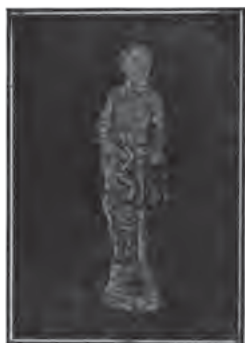
PRIAPUS AND SERPENT

This apparent contrast in the nature of the libido is strikingly illustrated by a Priapic statuette in the antique collection at Verona. 60 Priapus smilingly points with his finger to a snake biting off his "membrum." He carries